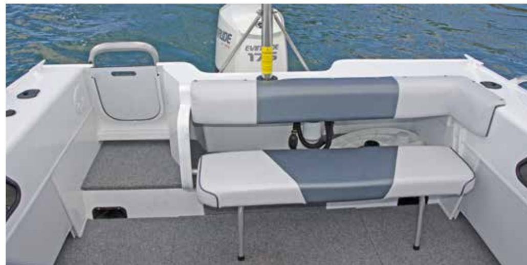
Navigator pedestal seats provide comfort for skipper and first mate. Passengers are similarly spoiled with a comfy rear lounge.

With a 175hp Evinrude E-TEC on the transom, there are zero complaints on the power side, as these low-emission V6 two-strokes have all the punch needed to pull skiers out of the water, as well as easily achieved top-end speeds of around